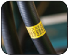
Cable wrap/Cable flag