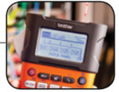
Large backlit graphic LCD display