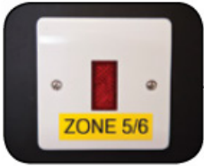
Label socket outlets, network points and faceplates