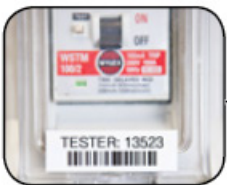
9 barcode protocols