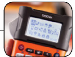
384 built-in symbols