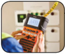
Prints labels 3.5 to 18mm in width